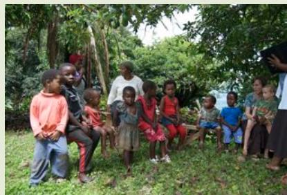
Helping a family in need in Mbekelweni. The grandmother and great grandparents are caring for 10 orphans. We know for certain that 2 are HIV positive.